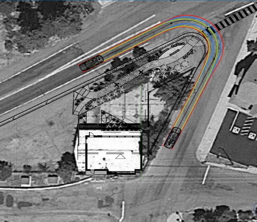
Car Turning Movements