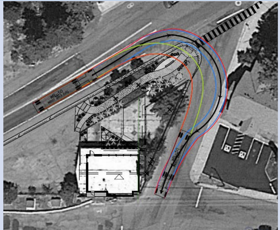
Truck Turning Movements