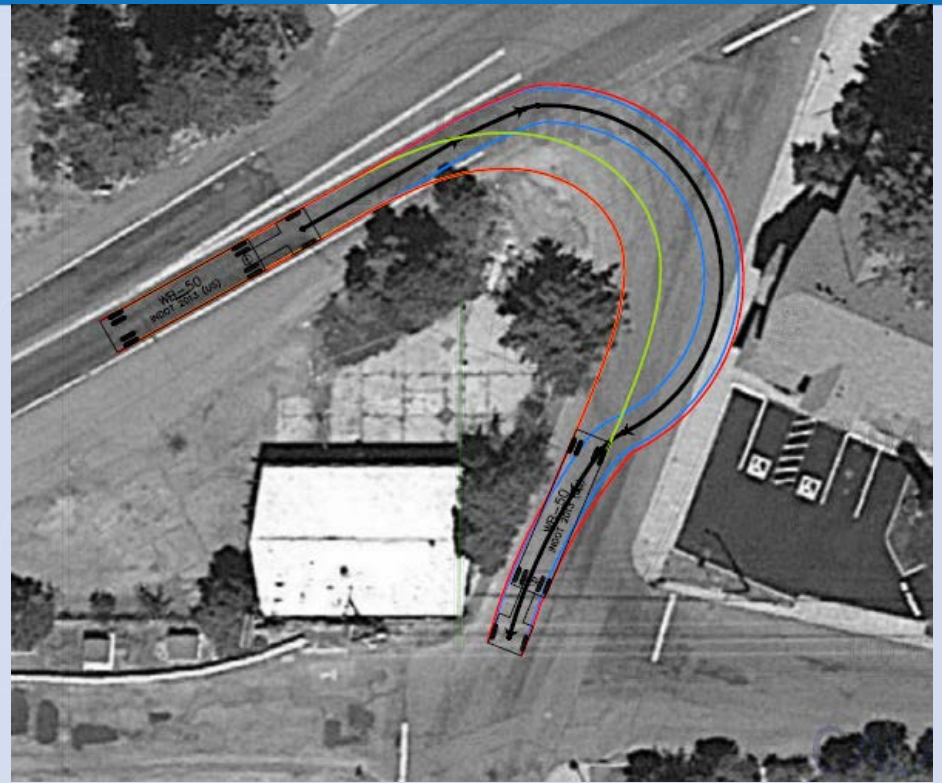
Truck Turning Movements