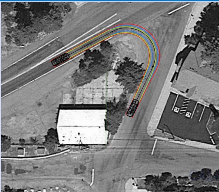
Car Turning Movements